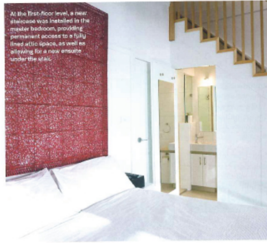
At the first-floor level, a new staircase was installed in the master bedroom, providing permanent access to a fully lined attic space, as well as allowing for a new ensuite under the stair.

The main consideration of the design was to maximise the living area and fully utilise the available space within the house while improving the level of natural light able to be brought into the home. The key examples of this were the increased footprint of the living area with its glazed roof, the creation