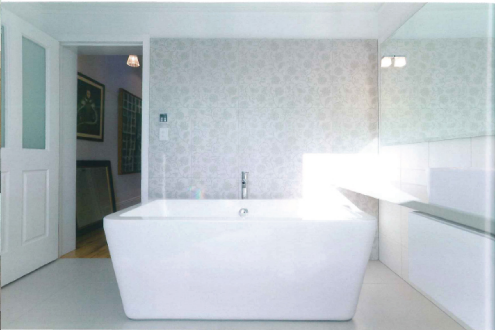
Floor tiles in the fresh white bathrooms are fully vitrified porcelain Vita White, while wall tiles are rectified glazed porcelain Silk Doco Bianco and pressed glazed porcelain Roca Matt White.

of the internal light court and the location of the ensuite under the new attic stair.