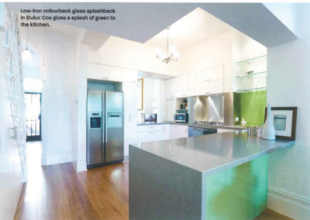
Low-iron colourback glass splashback in Dulux Cos gives a splash of green to the kitchen.

Prior to being renovated, this Melbourne house was a typical inner-urban period home in poor condition and in need of "tender loving care". It was a series of small, relatively dark rooms and was suffering from structural movement. There was also evidence of borer activity.