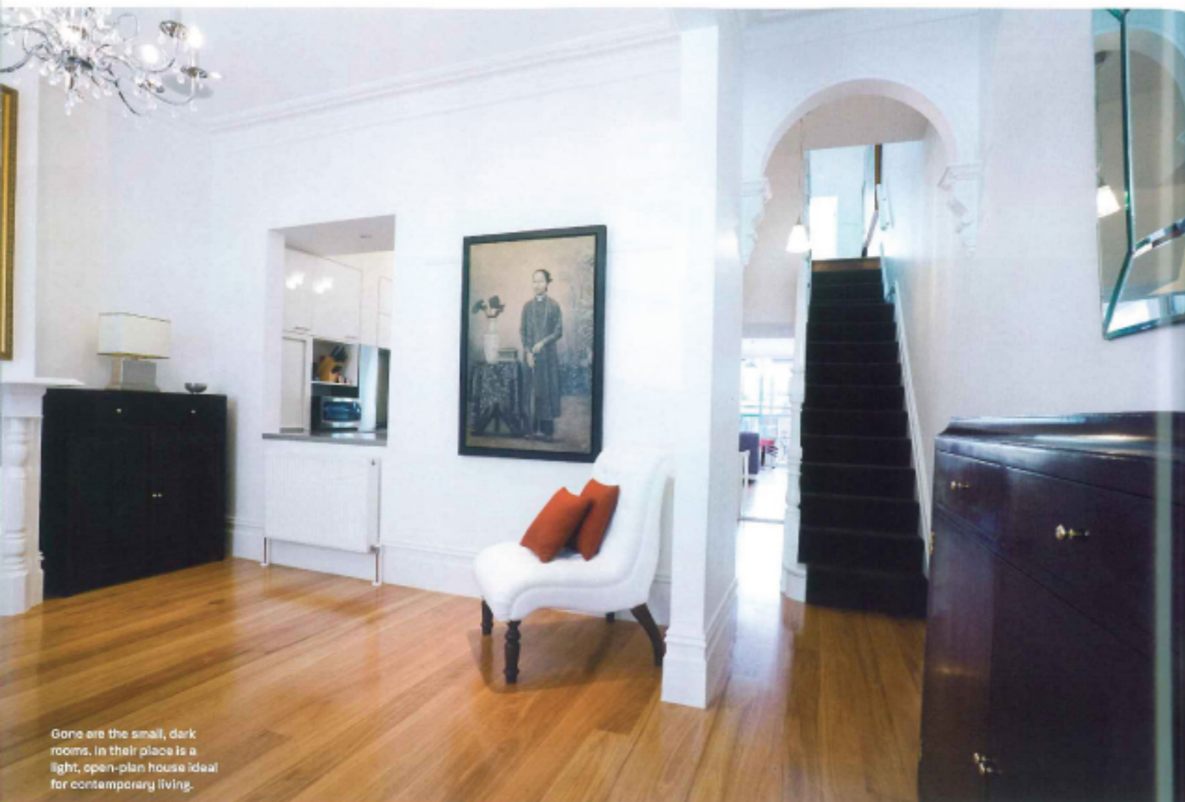
Gone are the small, dark rooms. In their place is a light, open-plan house ideal for contemporary living.