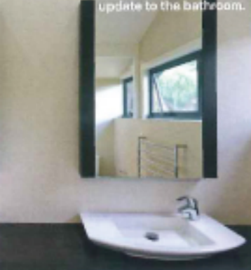
A double vanity is a much-needed update to the bathroom.

Decades after it was built, the home has made its mark on the new millennium.