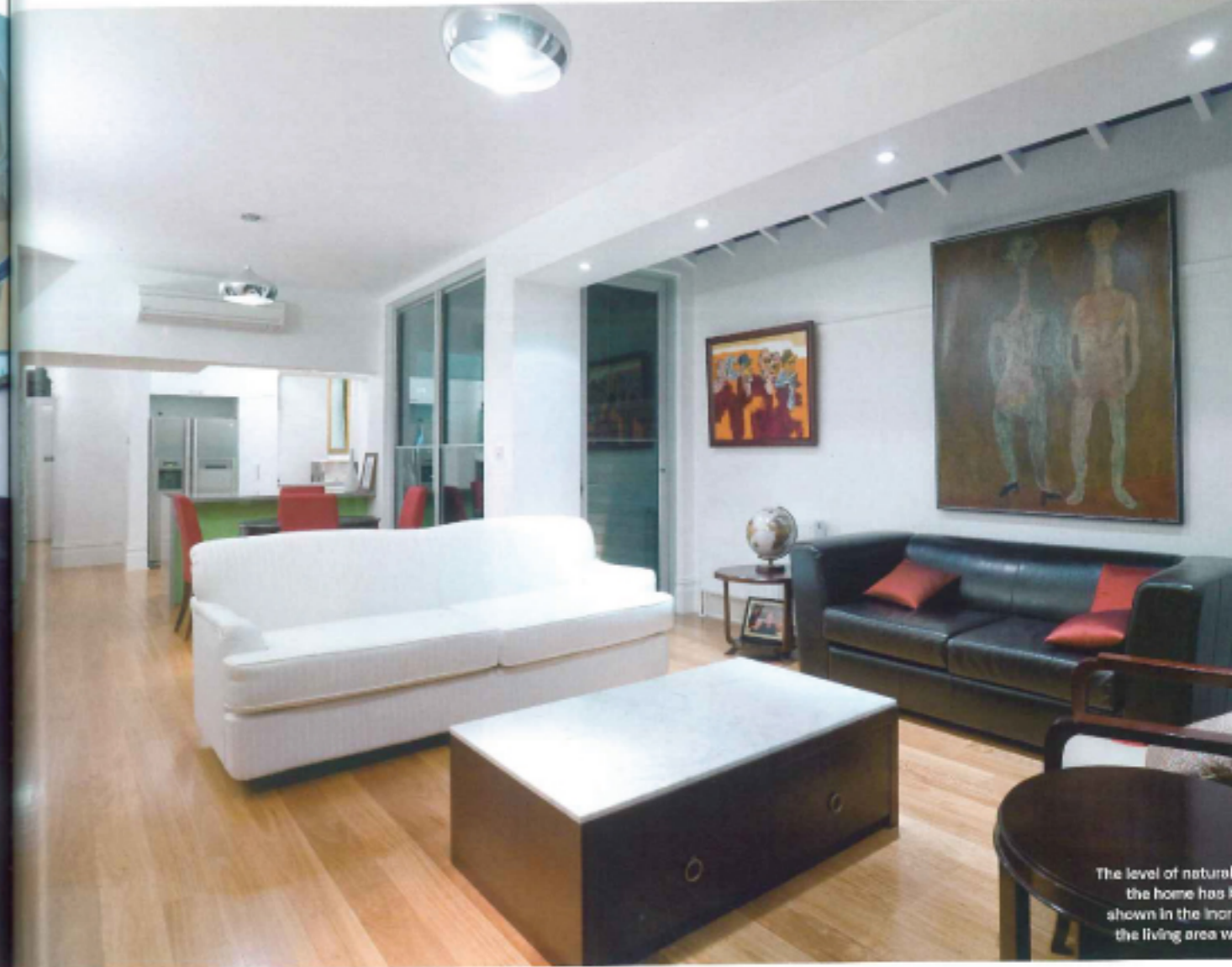
The level of natural light the home has is shown in the interior of the living area.