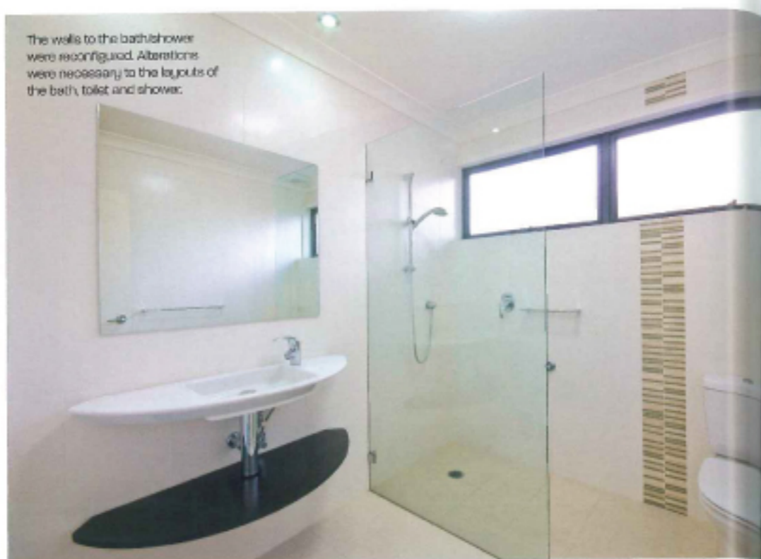
The walls to the bath/shower were reconfigured. Alterations were necessary to the layouts of the bath, toilet and shower.